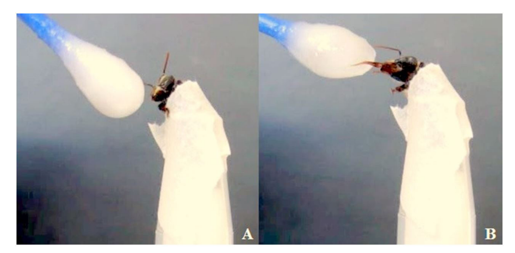
Figure 1. Forager of M. scutellaris subjected to the traditional PER harness test, with the body trapped with adesive tape and with free antennae and buccal parts. A – Offering water without proboscis extension; B – Offering sucrose solution 75% with proboscis extension.

The experimental protocol was based in the methodology used by Takeda (1961) and Bitterman et al. (1983). In order to put bees into plastic tips, bees were anesthetized (freezing) for 30 seconds. M. scutellaris bees were individually placed in plastic tips adequately cut that restricted the movement of the body but allowed the free circulation of the antennae and buccal apparatus (Figure 1)