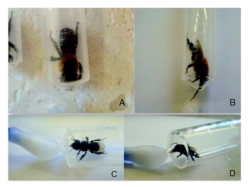
Figure 2. Forager of M. scutellaris and S. postica subjected to the PER test in plastic tube (eppendorf), with free-moving bodies. A and B: Forager of M. scutellaris ; in A without offering the sucrose solution and; in B offering sucrose solution 50%, with proboscis extension. C and D: Forager of S. postica ; in C without offering the sucrose solution and; in D offering sucrose solution 50%, with proboscis extension.

In the traditional PER only 12.5% of the total bees of M. scutellaris tested (n= 80) presented positive response only to the sucrose solution at 75%, after 4 hours of fasting. For the sucrose solution of 25% and 50% there